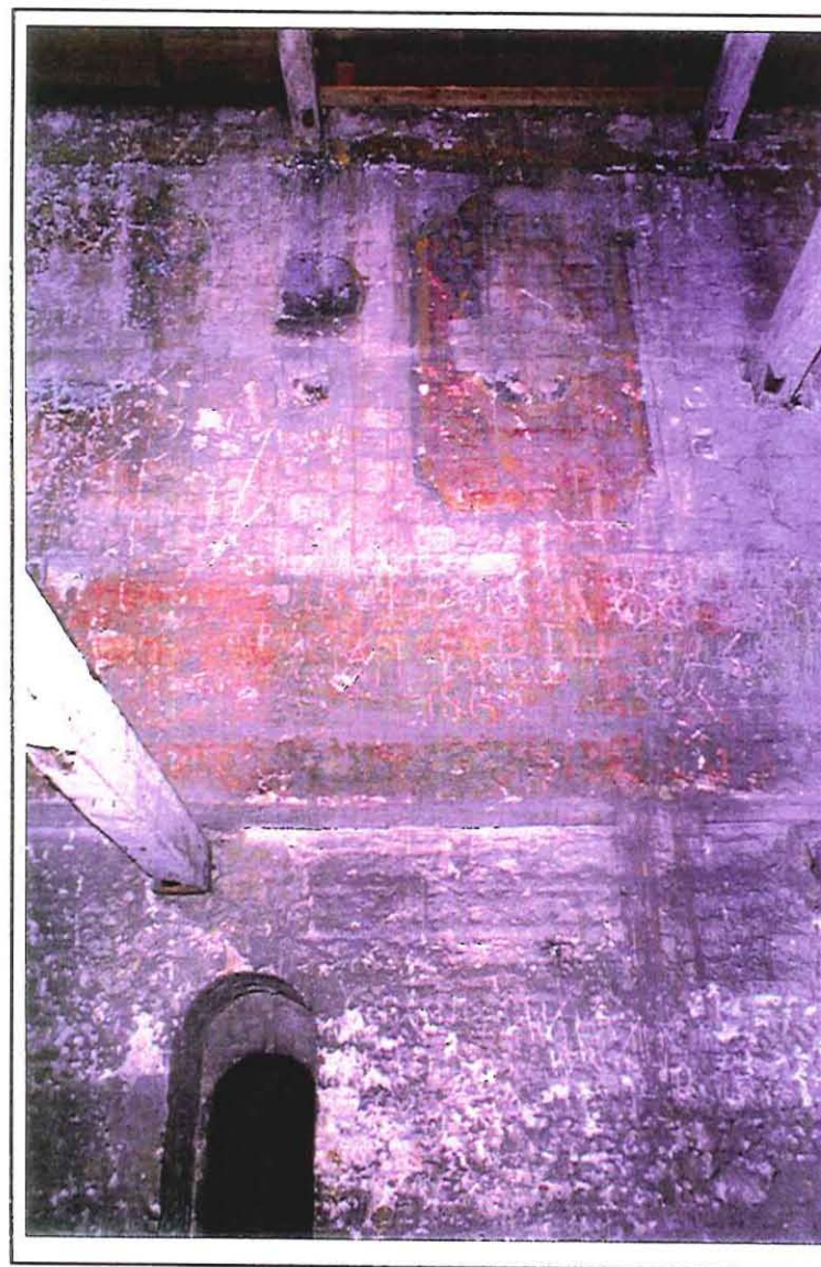
Detail, south side of spine wall, painted cartouches