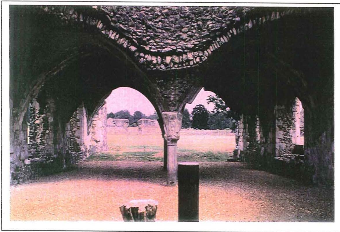
Lay-brothers range, general view to north