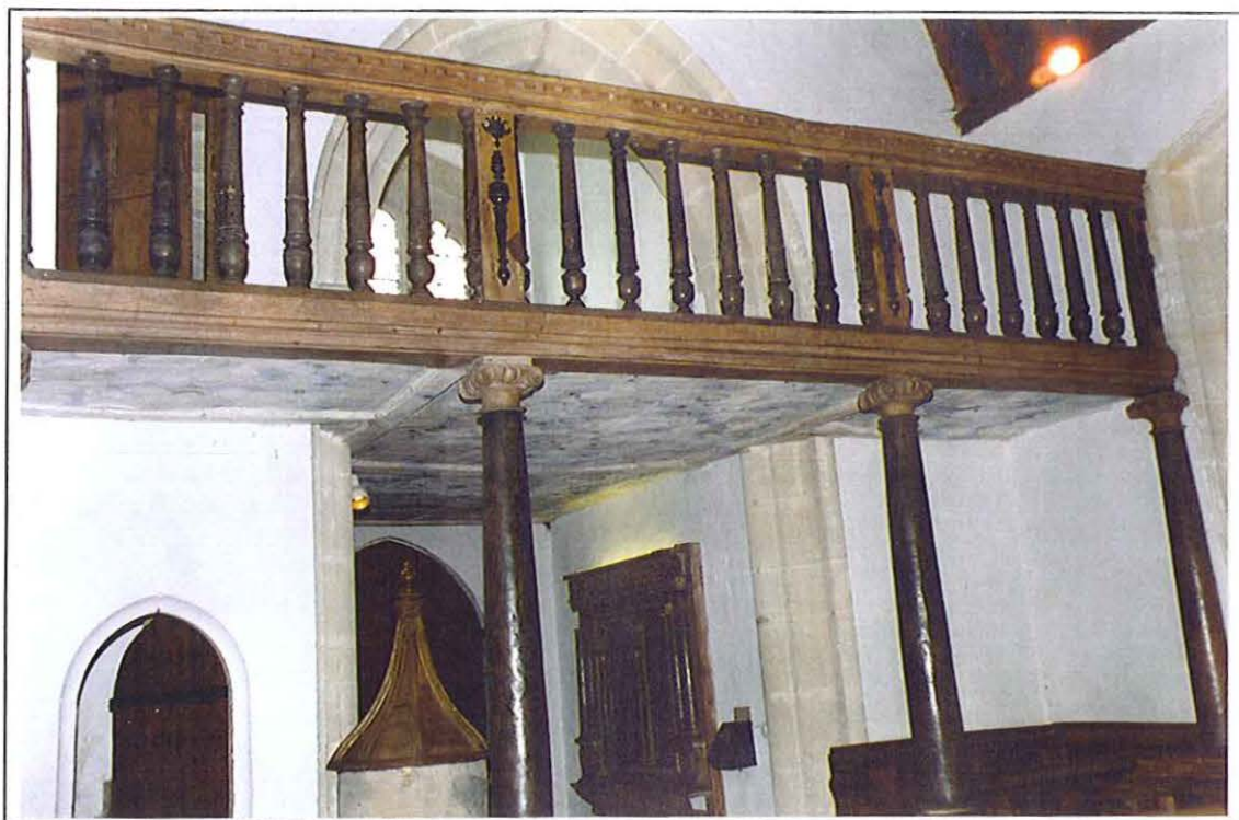
Western Gallery, general view to west