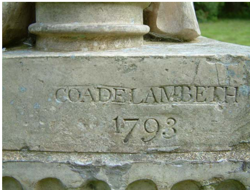
Fig 1. Plinth inscription on one of the West Dean Statues

Six fragments of concrete-like material were submitted for investigation prior to a visit by summer school students from West Dean College. The fragments came from two female statues in the grounds of the College (designated North Figure and South Figure respectively) which are known to be made of an artificial stone called Coade Stone. This material was developed in the late 18 th century by Mrs Eleanor Coade as a ceramic stone substitute. It became a popular substitute for marble because of its colour and durability compared to traditional terracotta and was used by many leading architects to embellish buildings, including those of royalty and the aristocracy. Mrs Coade established her factory on the south bank of the river Thames at Lambeth in 1769 where it continued in production until 1840. The plinth of one of the West Dean statues carries the inscription 'Coade Lambeth 1793' (Fig 1).