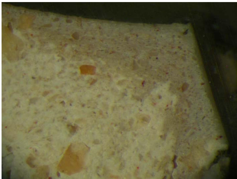
Fig. 4. Optical micrograph of fragment of the base of the South Figure showing surface coating.

physical difference. The largest piece analysed, the fragment from the base of the South Figure, has a partial surface coating that appears as a quite distinct layer, although it is also heavily vitrified (Fig 4).