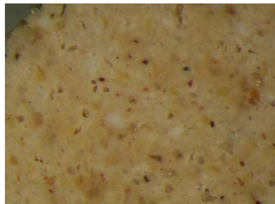
Fig. 3. Vitrified body x 40

This can be explained by the fact that some of the fragments submitted for analysis were loose pieces associated with both the statues and not actually removed from them, and these included the un-vitrified samples (one from each statue). Thus the identification of the non-vitrified samples as being fragments of the original Coade Stone statues is purely circumstantial and is further called into question by their obvious