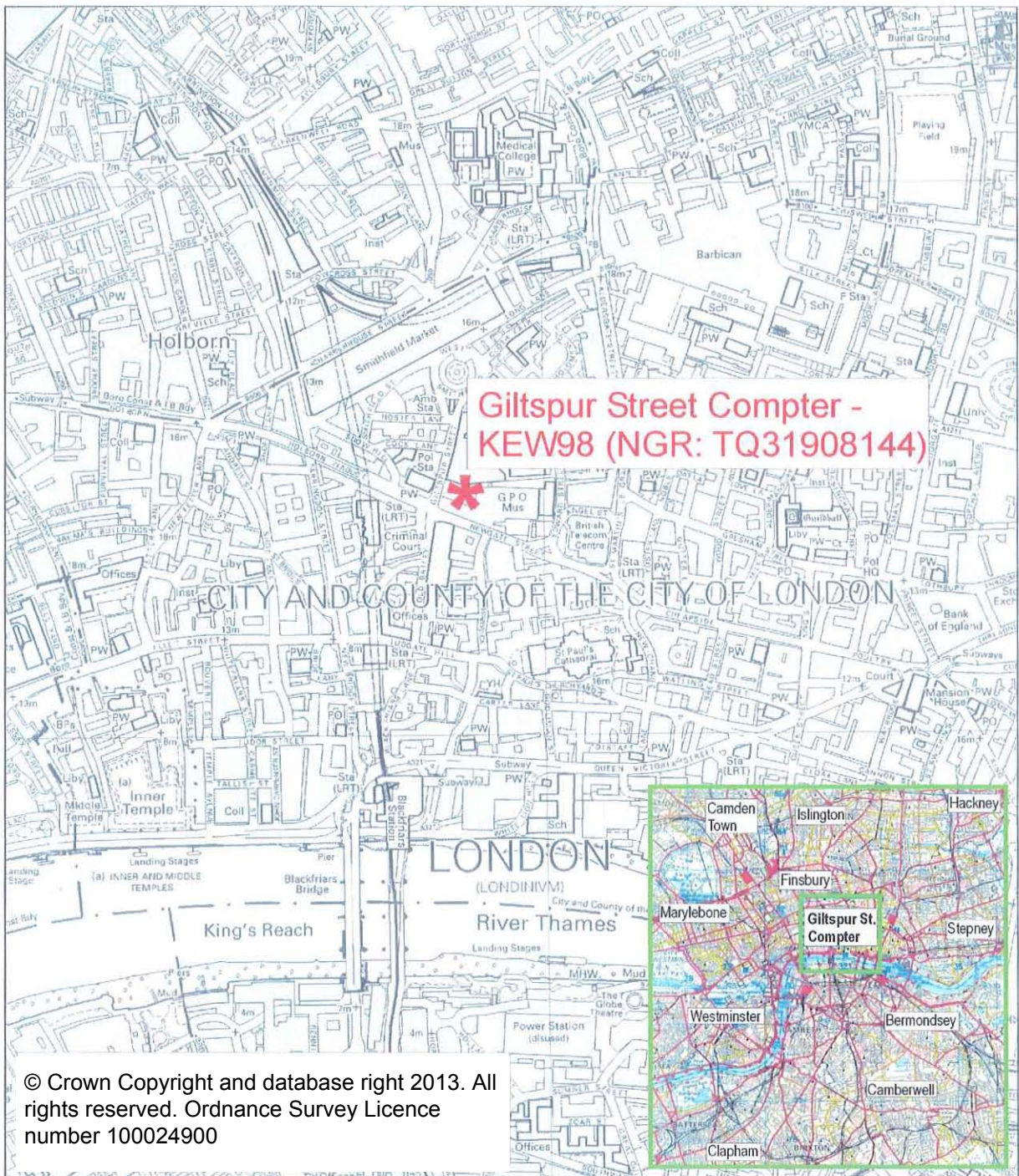
Figure 1: General location of Giltspur Street Compter