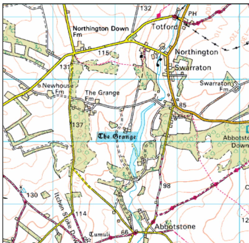
Figure 1: Map showing the location of The Grange.

The dates derived for the felling of the trees used in construction do not necessarily relate directly to the date of construction of the building. However, evidence suggests that, except in the re-use of timbers, construction in most historical periods took place within a very few years after felling (Salzman 1952; Hollstein 1965).