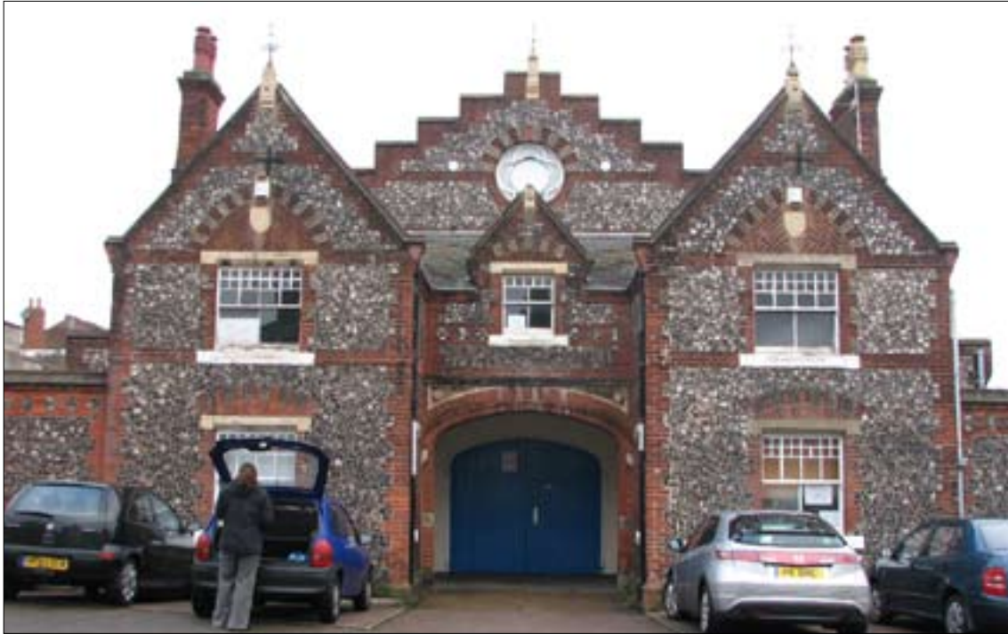
Figure 2. Southern facade of the drill hall.