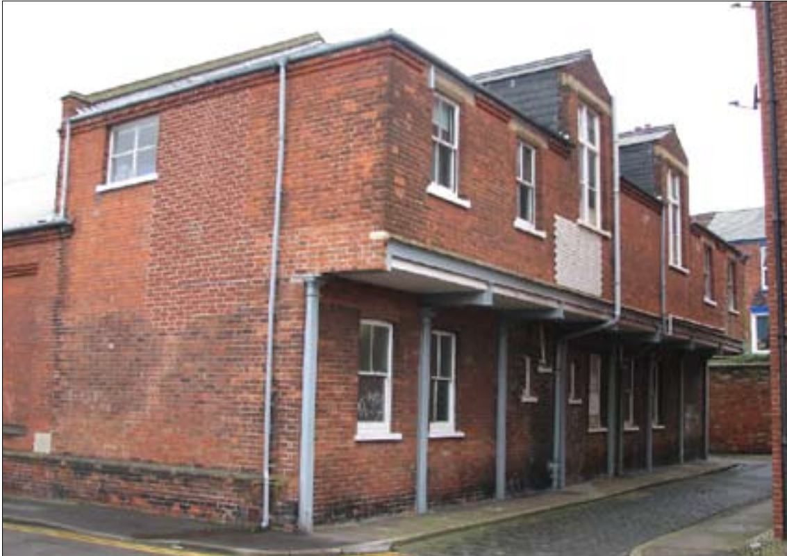
Figure 8. The rear block.