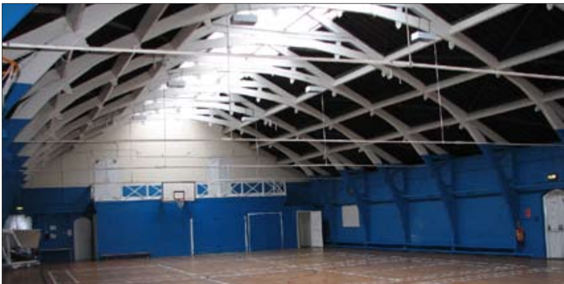
Figure 7. Interior of the drill hall looking north.

The wooden floor appears to be original and is laid on top of concrete so as to minimise the noise from drill marches. At first-floor level along the south wall are the remains of six timber supports for a viewing gallery (no longer extant) with a blocked two-centred arch headed doorway on the first floor to the west side. As galleries were generally used by the public it would appear that the eastern part of the front block allowed access to this gallery and was not, therefore, part of the private accommodation. A matching gallery existed at the north end of the hall (although this has been replaced) and was accessed via a pair of doors at first-floor level. A two-centred arch headed doorway is found to either side of this end wall, matching those seen elsewhere, whilst two further doorways are found nearer the centre of the wall. Central heating in the form of substantial hot water pipes, heated by a boiler in the rear block, runs around the room at floor and head height and, if not an original feature, is certainly not much later than 1867.