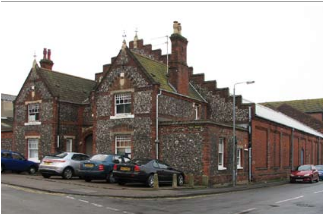
Figure 6. Front block with the drill hall behind.

The stepped southern gable wall of the hall forms the rear of the front block and accordingly is constructed from matching red brick and flint. The apex of the gable is topped with a finial to match those on the front gables, whilst the circular window containing quatrefoil glazing has a polychrome brick surround to its upper half and a plain red brick surround to its lower half, continuing to either side as a band. The main structure (Fig. 6) is 10 bays long, constructed from red brick in Flemish bond on a brick plinth with no windows or doors along the west wall and a single doorway in the fifth bay from the south along the east wall. The hall is lit from above by a skylight running the length of the hall along the apex of the roof. Whilst this is not an original feature it replaced an earlier version which, as may be seen in Fig. 4, was originally in the form of a ridge lantern.