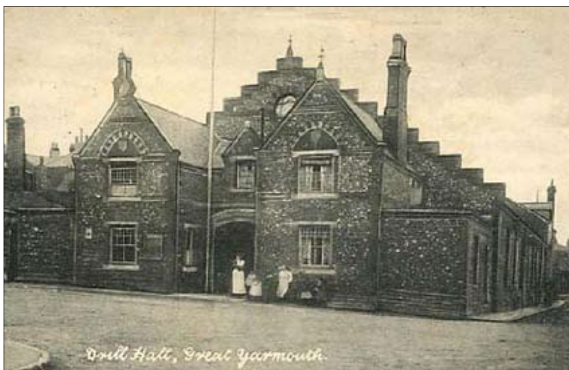
Figure 5. The drill hall shown in a postcard of c.1911.