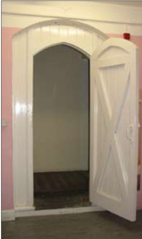
Figure 9. External door reset in an internal doorway.