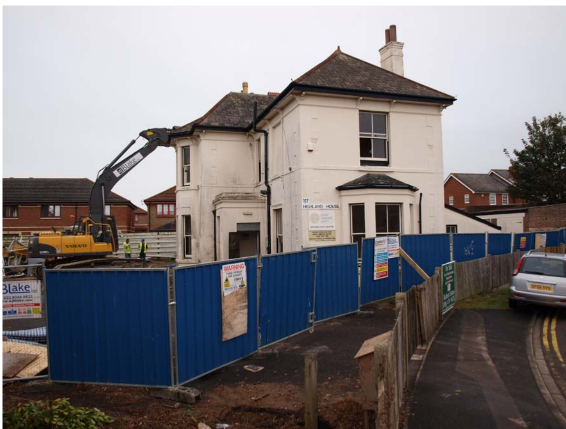
Figure 1. Highland House, 117 Lidiard Gardens, Southsea in October 2009