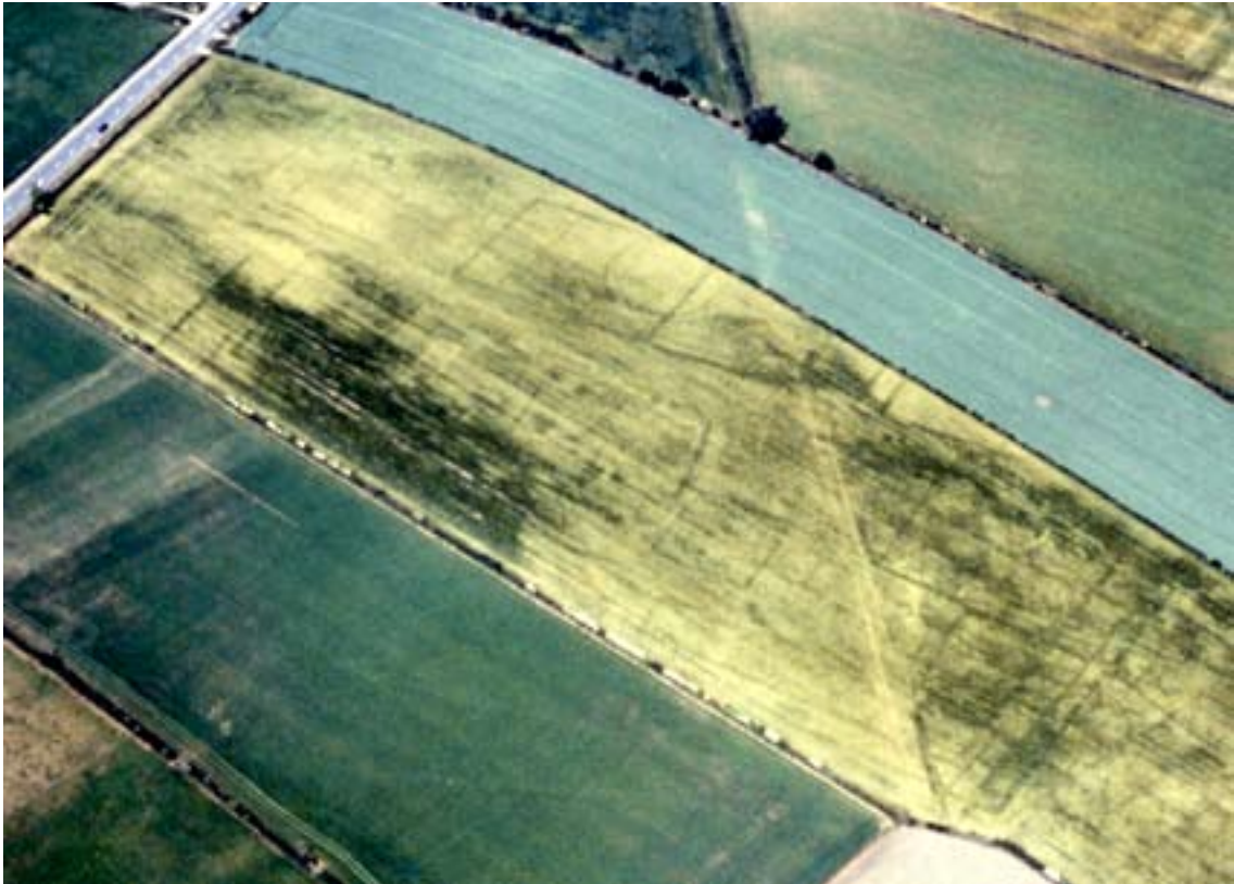
Figure 2. Cropmarks of a late Iron Age 'ladder' settlement illustrating a continuation into the Roman period.

focal point of the settlement, consisting of a group of structural elements representing at least two buildings lies adjacent to the masked area. Perhaps the most well-defined of these buildings is aligned along the western element of the central trackway (fig. 2 inset: K). This structure measures approximately 30m in length by 6.4m wide, and appears to display at least four internal partitions. A possible narrower structure, more irregular in plan, abuts this building to the south. A further negative cropmark was noted to the south of these buildings, in the same alignment and also extending parallel to the trackway for 16m, though no return was visible suggesting this to be a stand-alone wall.