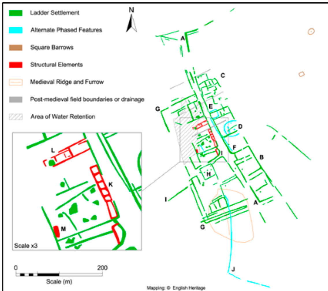
Figure 3. A breakdown and interpretation of the transcribed archaeological cropmarks at Brompton-by-Sawdon.

and Burythorpe to the south of Malton; and the more dispersed sites of Hovingham, Beadlam and Spaunton to the north of York, amongst others. The Brompton structures were originally viewed as a potential villa site, though without further evidence the cropmarks lack many of the characteristics of a typical Roman villa. There is no evidence of a 'winged' complex of buildings, nor an immediate suggestion of a courtyard appearance. The Brompton buildings do however suggest a complexity beyond that of a simple farmstead, and as Powlesland states: "sophisticated stone buildings ... were the exception rather than the rule" (2003, 28). Rather than superseding an earlier Iron Age village, the Roman structures appear to be contiguous with the ladder settlement, to the point where the partitioned building (fig. 2: K) clearly fronts along the trackway. The complexity of the north building (fig. 2: L) cannot be ignored, also abutting the trackway and with possible finer internal partitions and corridors. It is important to note that this building lies immediately adjacent to a large area of water retention preventing the formation of cropmarks, which may mask further settlement features. Only further research, such as geophysical survey, could help to determine their function and allow a more accurate interpretation of the site.