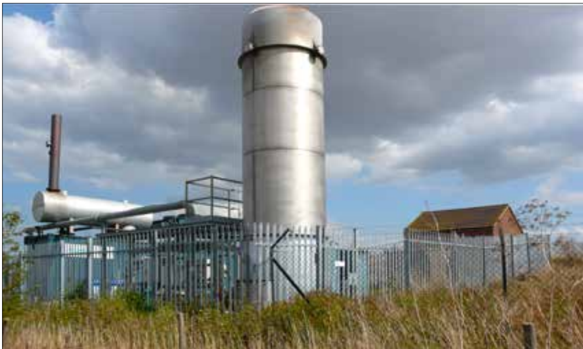
Figure 7 Biffa Environmental Technology Plant on the site of Shakespeares Farm (P5733072)

Other developments affecting the parish include the opening of a landfill site on the site of Shakespeares Farm in the late-20 th century, operated by the waste management group Biffa (Fig 7). The anti-aircraft battery and associated camp was initially retained after the war as a Nucleus Force Battery Headquarters. 29 After this was closed the battery was cleared and its site was reused for a residential development, Bellwood Court, and a small industrial estate.