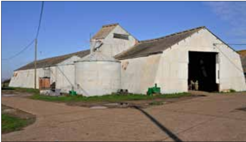
Figure 12 Moat Farm reused part of a World War One balloon store as a grain store, now a grade II listed building (P5733076)

group was given further interest when part of a World War One airship shed was reassembled here for use as a grain store (listed grade II). This is formed of the canted roof of the timber-framed balloon store, clad in corrugated metal (Fig 12).