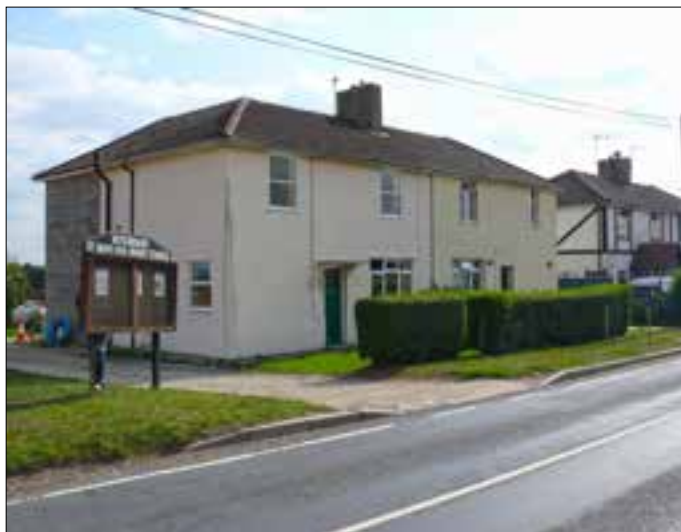
Figure 5 St Mary's Cottages beside the Ratcliffe Highway consist of 12 semi-detached houses that date from the 1920s and formed part of the initial phase of local authority housing across the peninsula. (P5733070)

On the east side of the parish several loose clusters of farmsteads and farmworkers cottages had developed. One was Bell's Farm and a small development of three pairs of cottages with substantial gardens, known as Coombe Houses and therefore presumably associated with Coombe Farm. In 1887 a row of five workers' houses, Rose Cottages, were built at the junction of the Ratcliffe Highway and an access road to Coombe Farm, sometimes referred to as Coombe Corner. This was near a section of the Ratcliffe Highway that followed the field boundaries, creating a succession of sharp bends. Further development occurred in the 1920s when Hoo Rural District Council constructed 12 semi-detached houses, known as St Mary's Cottages on a site beside the Ratcliffe Highway and opposite the access road to the village (Fig 5). These were part of the initial phase of local authority housing across the peninsula, intended to replace the poorest quality accommodation.