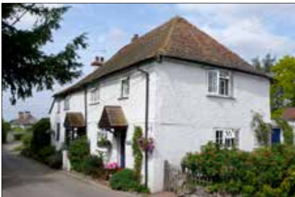
Figure 13 Sage Cottage and Church Cottage possibly dates from before 1800 and seems to have originally been a single property (P5733077)

The Old Rectory (listed grade II) is a late-18th-century red- and brown-brick two-storey house, apparently constructed in two phases, with a weatherboarded extension. 34 It was possibly built for the Reverend Robert Burt, who lived here from 1786 and 1791,