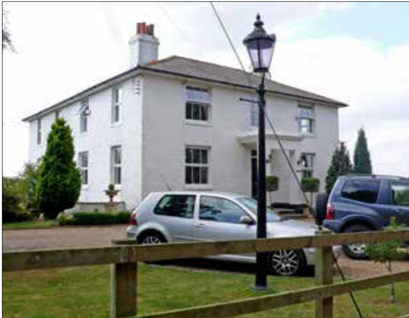
Figure 10 The former neo-classical villa-style farmhouse of Coombe Farm, now called Coombe House (P5733074)

built on adjoining land to the south. The site at Coombe has undergone more drastic alteration. Only its former farmhouse remains, built in c1860 to the south of the historic farmstead. Coombe House, as it now known, is a two-storey villa-type residence with white-painted rendered walls, a slate roof with overhanging eaves and a symmetrical three-bay elevation with a central porch (Fig 10). The complex of outbuildings was cleared in the 1980s. In the late-20 th century a detached house was built to the south of the house.