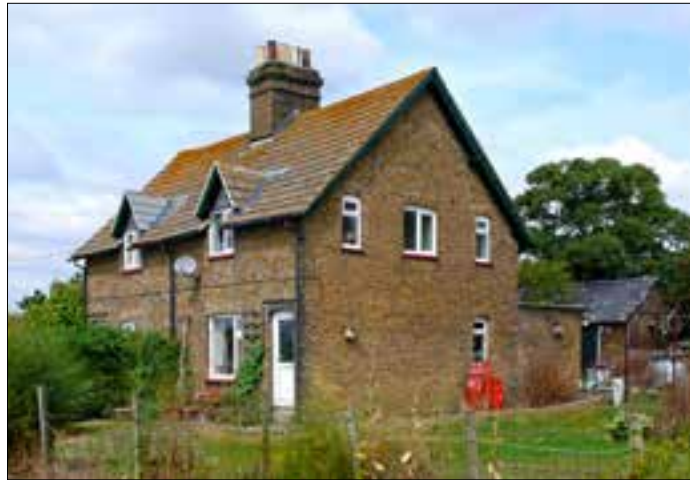
Figure 15 Nos 4-6, The Street: a surviving pair of late-19 th century farmworkers' houses in St Mary Hoo. (P5733079)

Two pairs of farmworkers houses were erected in the village in the late-19 th century; one survives (4-6 The Street) (Fig 15), the other (Pond Cottages) was replaced in the late-20 th century by a house (Pudding Cottage). A modest amount of back-plot infill has taken place in the late 20 th or early 21 st century, with the construction of a small number of bungalows.