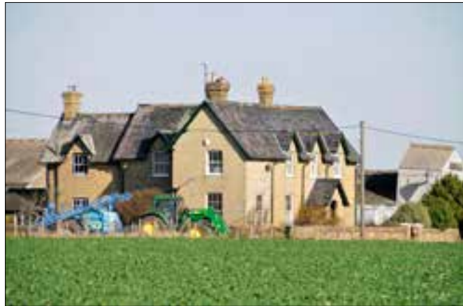
Figure 6 The earliest components of Moat Farm date from the 1870s, when the entire farmstead was completely rebuilt. (P5733071)

One consequence of farm amalgamation was the subdivision of farmhouses into cottages. This had occurred at Bells Farm and Ross Farm by the 1830s and at Hoppers Farm by the 1860s. 20 There seems also to have been a gradual decline of the marshland farms. During the 19 th century Egypt Marsh Farm was merged with part of Ross Farm. 21 Similarly, a marshland cottage, Wick House, near St Mary's Bay, extant in 1839 was gone by the centuries' end. Lowlands Farm, to the north of Moat Farm, had lost its outbuildings by 1908 and had been entirely cleared by the