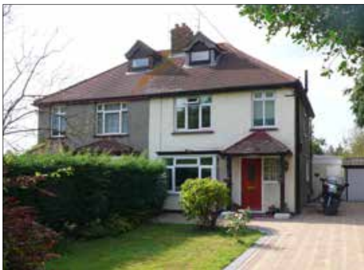
Figure 17 West Willows and East Mead replaced a modest waste land cottage in the inter-war period. (P5733081)

is commemorated with a 1760 date stone. Its 19 th -century timber outbuildings and barn also survive, the latter converted to residential use. A small brick and thatch outbuilding in the grounds of a mid-20 th century house Fenn Cottage, may be a remnant of a row of tiny farmworkers cottages that were associated with Fenn Farm. The Fenn Bell Public House is the product of several phases of construction from the 18 th century onwards, although the building may contain earlier fabric. During the 1880s the landlord was the memorably named Time Of Day. 36 The building also retains a 19 th -century barn and stable. A group of 20 th century houses including Fenn House Farm and Nos 1-2 Forge Cottages occupy the site of the other historic farmstead and its associated cottages and smithy. 37 An inter-war pair of cottages (West Willows and East Mead) (Fig 17) and a late-19 th century house (Little Acre, formerly Myrtle Cottage) replaced two modest waste land cottages.