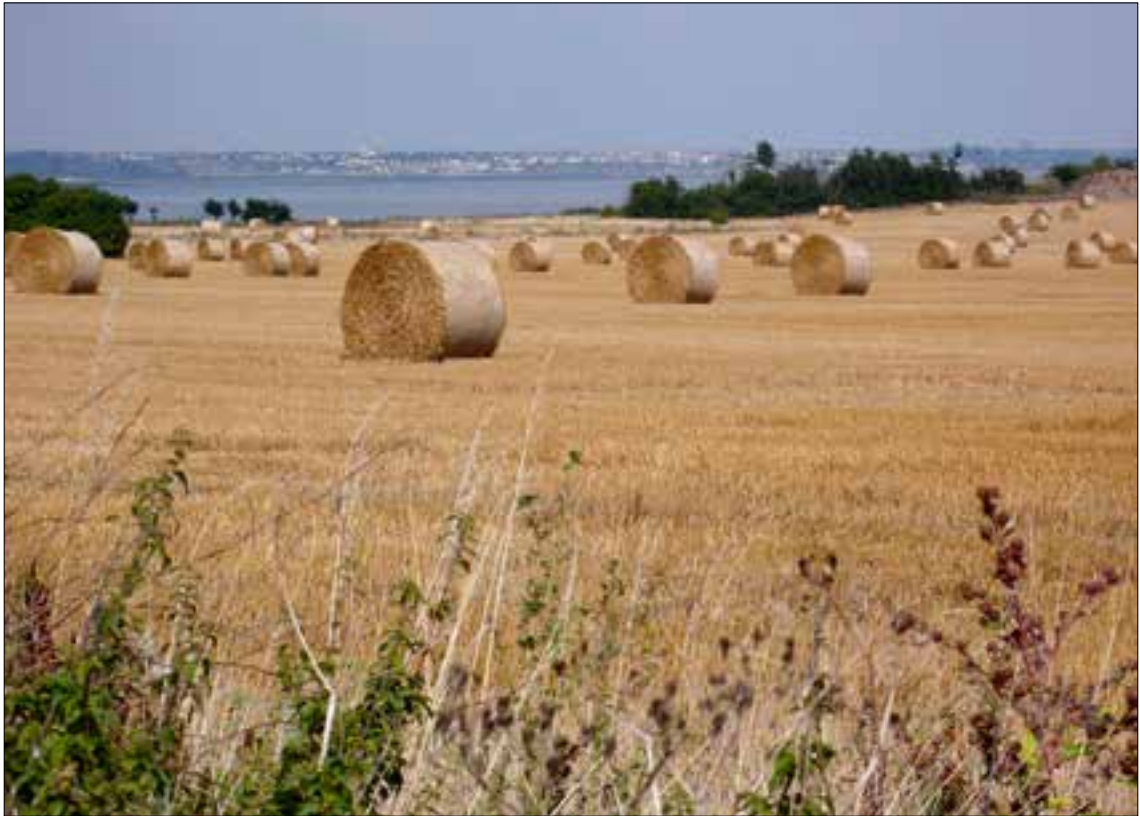
Frontispiece; 'St. Mary Hoo is a farming parish ... As you walk across its fields, superb views march beside you across the Thames Estuary to the north'