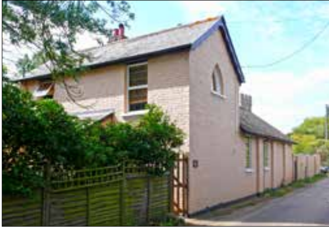
Figure 3 St Mary's Parochial School, built by the National Society in 1868 (P5733069)

and westwards to Newlands Farm. Over the next century a number of the village houses were replaced and in 1881 St Mary's Church was partially rebuilt. The most significant addition to the village was St Mary's Parochial School, built by the National Society in 1868 (Fig 3). 14