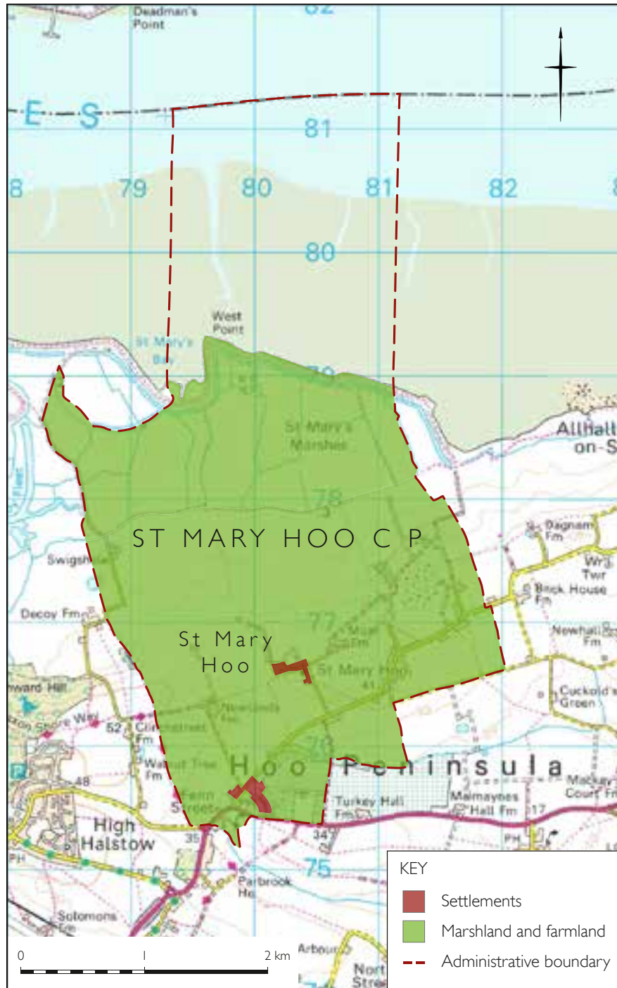
Figure 8 Character Areas of St Mary Hoo

St Mary Hoo is a predominantly rural parish (Fig 8). Its open landscape is a mixture of marshes and upland fields, with some small areas of orchard and woodland, that also encompasses former industrial sites and dispersed farmsteads. There are two areas of low-density settlement, the historic village and sections of ribbon development around the Ratcliff Highway.