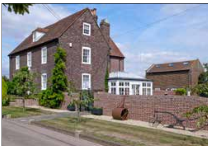
Figure 9 Newlands Farmhouse with a converted outbuilding to the right. (P5733073)

The parish's manorial sites all retain at least some historic fabric although Newlands Farm and Coombe Farm have now lost their agricultural function and have attracted subsequent residential development. At Newlands the handsome red-brick, two-storey farmhouse (listed grade II) bears a datestone of 1746. Its symmetrical front elevation faces east towards High Halstow (Fig 9). The farm outbuildings, ranged around an open courtyard to the west, probably date from the late 18 th to the early 20 th century. Some have been converted to residential use. A pair of late-19 th century farm workers cottages have been demolished and two semi-detached bungalows and a detached house have been