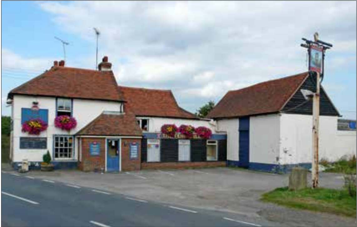
Figure 19 The Fenn Bell public house was in existence by the 17th century; its name was said to derive from one of the bells used to guide travellers across the marshes in poor weather (P5733083)