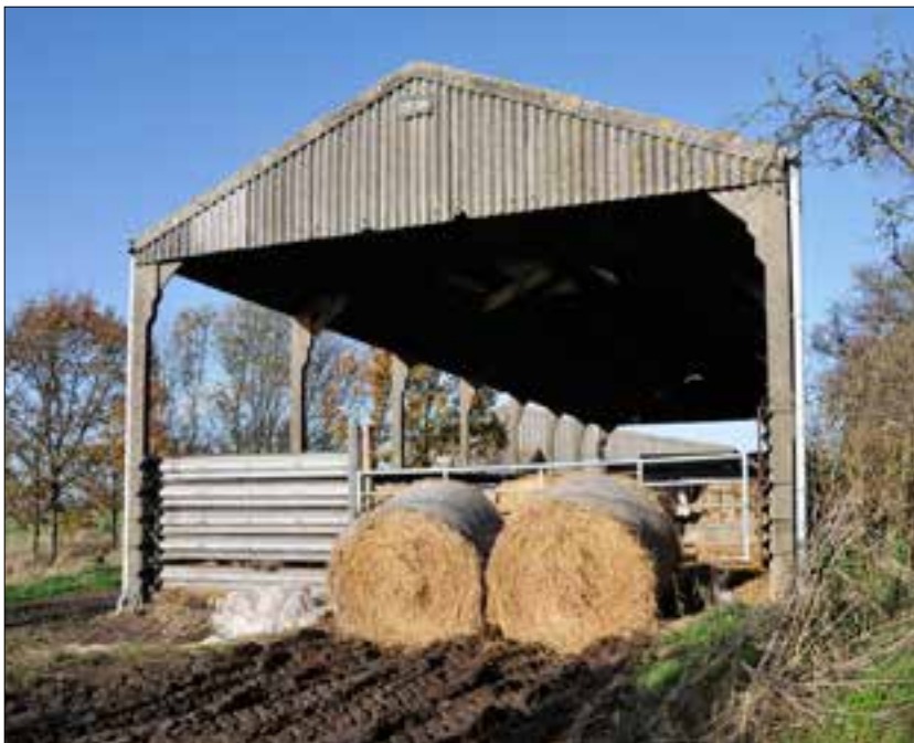
Figure 11 Large portal-frame agricultural sheds replaced the historic farmstead at Ross Farm in the mid-20 th century (P5733075)

To the south of the church is the manorial farm complex, St Mary's Hall. The farmhouse (listed grade II) is building of many phases, ranging from the 17 th century to the late-19 th century. The two-storey red-brick house, mostly painted white, was the home of Henry Pye between 1851 and 1909. Still an active farm, it has a timber-framed barn (externally of a 19 th century character), late-20 th century outbuildings and a walled kitchen garden. The historic farmstead at Ross Farm on the western edge of the village was cleared in the mid-20 th century, replaced by complex of large agricultural sheds (Fig 11). Immediately to the south are a pair of early 20 th century rendered houses, Ross Cottages; these replaced two older cottages belonging to the farm that stood adjacent to the village street.