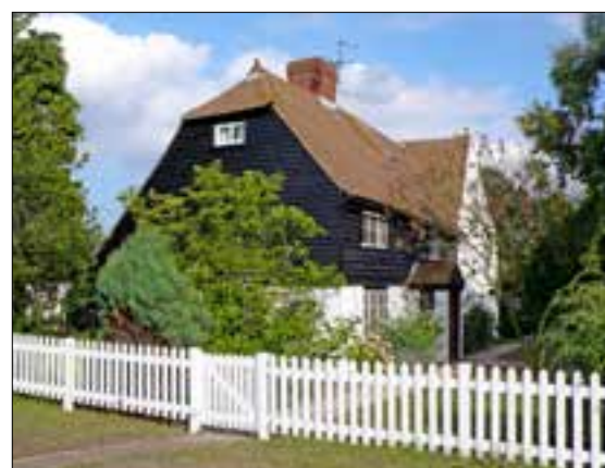
Figure 16 Fenn Farm retains its two-storey farmhouse which dates from the 15 th and 16 th centuries. (P5733080)

The most significant of these clusters is Fenn Street, situated between the villages of St Mary Hoo and High Halstow at the once ill-defined meeting point of the two parishes. The hamlet developed around two farmsteads and a public house and by the 19 th century had a population that was as large, if not larger, than St Mary Hoo. Although it has experienced a significant degree of rebuilding and new development in the late 20 th -century a number of historic buildings remain. Fenn Farm, on the south side of the road, retains its farmhouse (listed grade II), a two-storey building with painted brick and a timber-clad timber frame that dates from the 15 th and 16 th centuries (Fig 16). A later phase