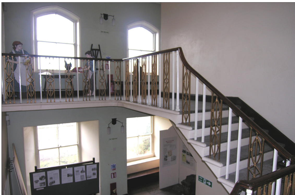
Fig. 5. The upper flight of the main stair, altered 1856-58, re-using the 1820s iron balustrade.