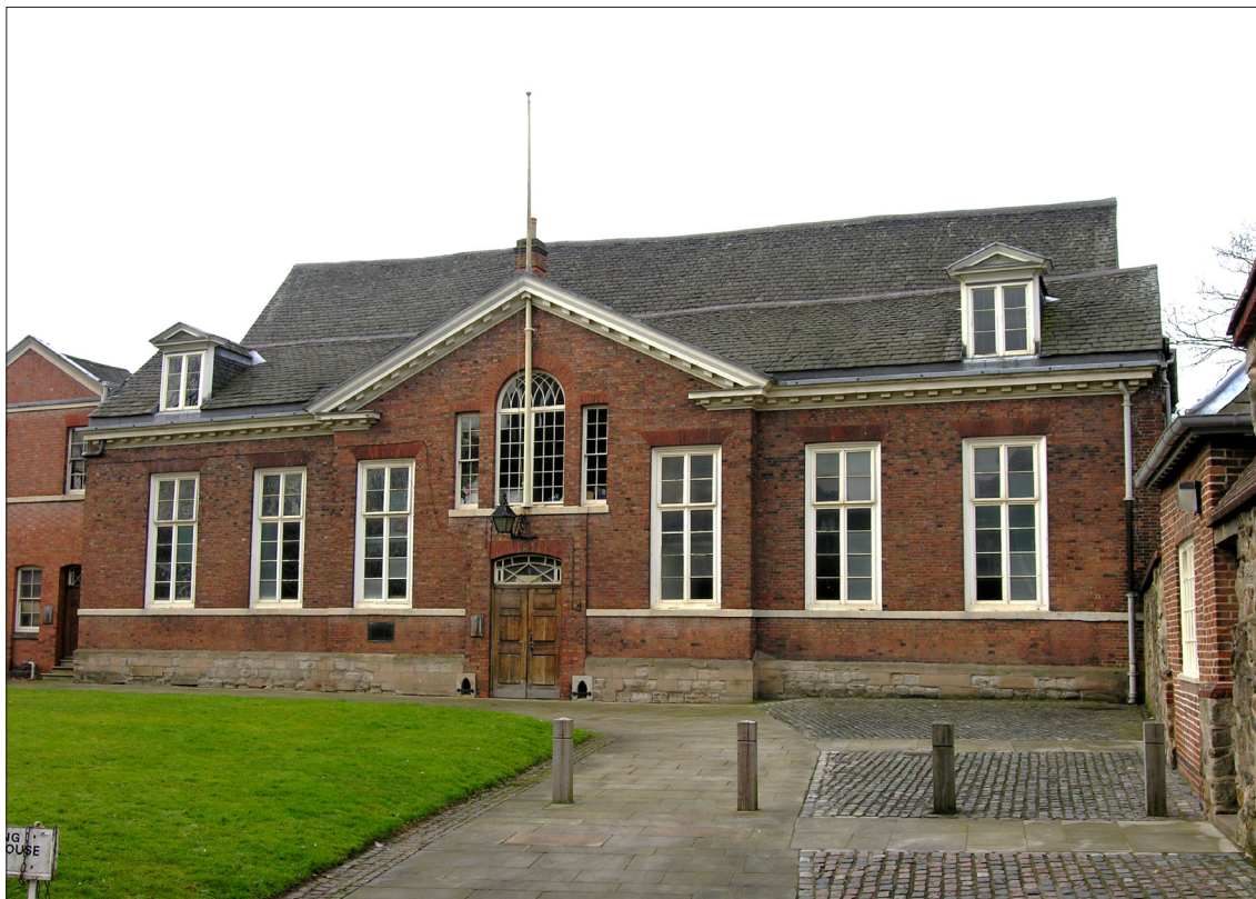
Fig. 3. The east front of the Great Hall as altered in the 1820s.

This arrangement of courts at either end of a single space, with no division between them, was common at this time. The fittings for each court were very basic; they included a raised dais and a central table with benches around it. The prominent spiral stair visible in the engraving of 1821 (fig. 1) led to an upper room lit by the windows in the pediment. This room presumably provided accommodation for judges and court officials and possibly the court records. This arrangement was swept away in the later 1820s when the present courtrooms and central hall arrangement was introduced.