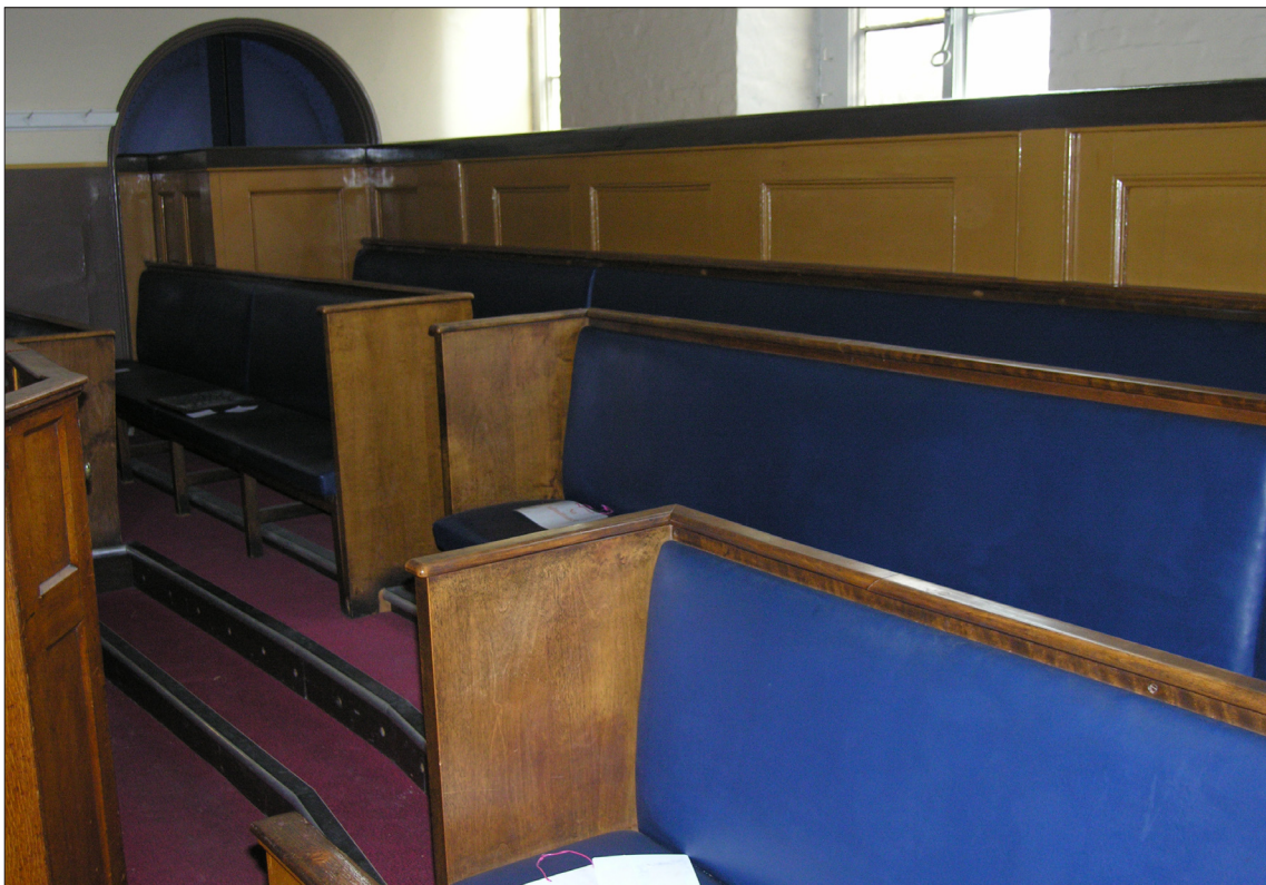
Fig. 9. The south Criminal Courtroom, the public seating inserted in the 20 th century.