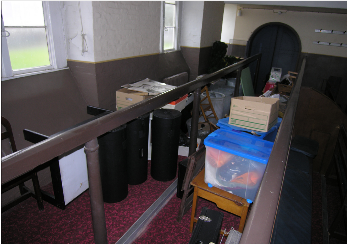
Fig. 8. The north Civil Courtroom, the surviving standing rail in the public gallery.