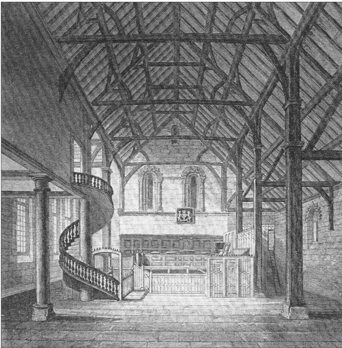
Fig. 1. The interior of the Great Hall in 1821, showing the Assize Court fittings at the south end.

This Great Hall was built in the 12 th century as part of the post-conquest castle. It was originally an aisled hall with timber aisle posts, though these posts have been removed on the east side and buried within later walls on the west side. The original clerestory was removed and the roof replaced in the 16 th century (fig. 1); between c.1502 and 1530 according to recent dendrochronology results. 1