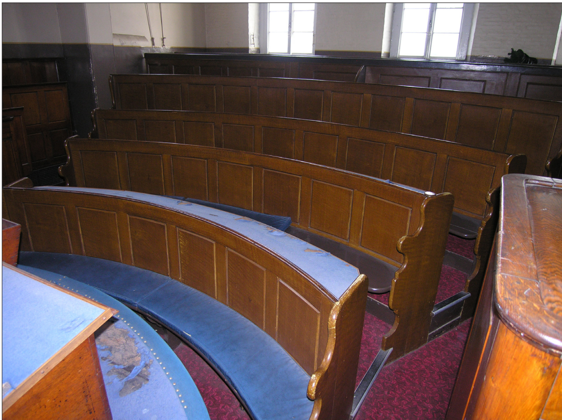
Fig. 7. The north Civil Courtroom, showing the curved benches installed in the 1820s.