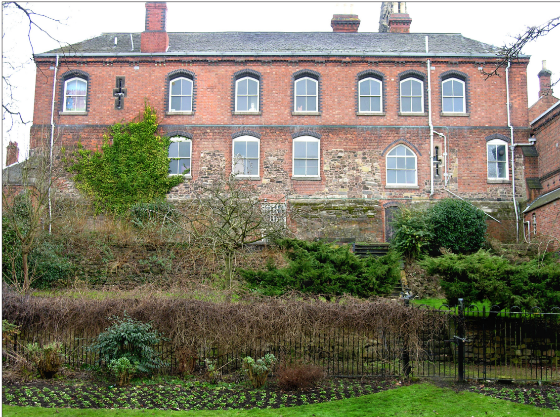
Fig. 4. The west front of the Great Hall altered by William Parsons 1856-58.

(from east to west) were inserted dividing the hall into three. The central space became the combined entrance hall and stair hall, flanked by two separate courtrooms, one to the north for the Quarter Sessions and the other to the south for the Assizes. The remodelling of the central hall also involved the alteration of the 17 th century brick east façade. A new doorway was added and a Venetian window was inserted at the first-floor level which necessitated the alteration of the pediment above (fig. 3). A new two-storey wing was added to the south of the Great Hall containing the barristers' rooms, and cells were installed below the south, Assizes courtroom.