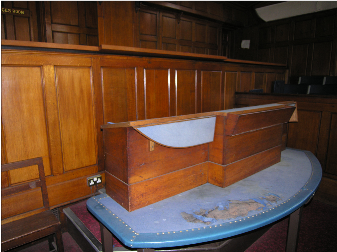
Fig. 10. The north Civil Courtroom, the panels in front of the judge's seat showing the four original central panels and the later panels added at either side.

This use of curved benches was popular in the early 19 th century in civil courts. The witness box is sited on the south side in this court, again it has panelled sides with curved corners. There is further seating on the north, here the benches have been removed and replaced with chairs and the back panelling has been reduced in height. All along the west side is bench seating for the public which appears to have been altered in the later 19 th century. The original public gallery behind this seating survives intact with its central standing rail (fig. 8), this area is accessed from the double doors in the lobby. As in the Criminal Court, the narrow upper gallery on the south side was probably used as a press gallery, or for extra public seating.