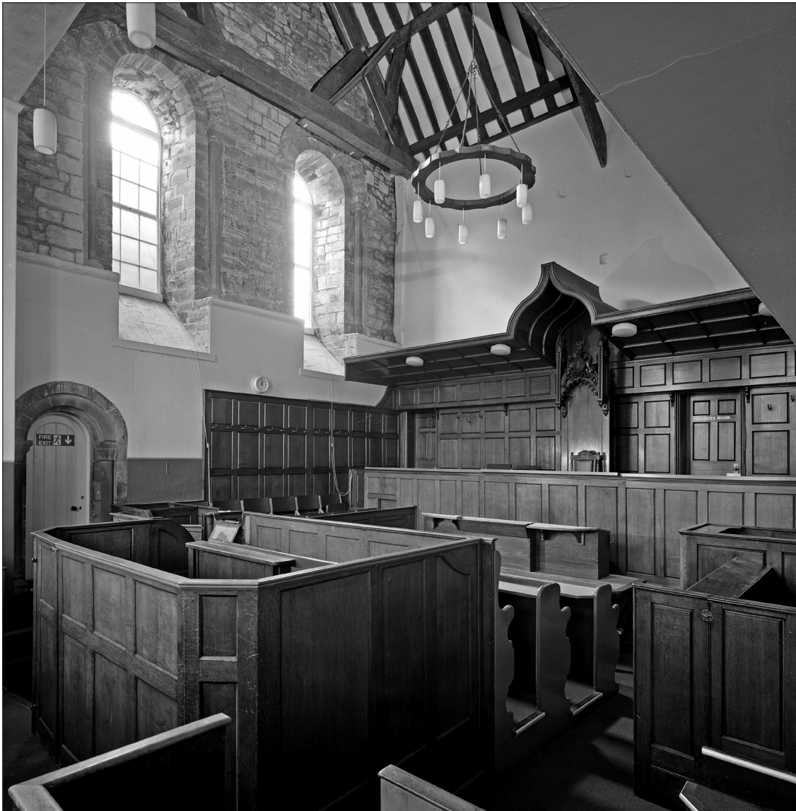
Fig. 6. The south Criminal Courtroom, showing the fittings inserted in the 1820s, with later alterations.

This courtroom has a raised dais along its west side (fig. 6). This west wall is panelled with a continuous canopy above. The panelling is early 19 th century, though the upper tier of panels appears to have been reused at a later date, probably when the canopy was added in the later 19 th century. The canopy has a central ogee hood over the judge's seat; this seat has a back panel topped with the royal coat-of-arms dating from the same period. This west wall has doors leading to the accommodation for court officials rebuilt in 1856-58. The panelled front to the judge's bench is early 19 th century, though extended in the later 19 th century, the clerk's desk in front is largely 20 th century. The three rows of painted benches, which occupy the centre of the court and have panelled backs and curvaceous bench ends, date from the 1820s. The witness box to the north is panelled with curved corners; it has a separate access doorway from the entrance hall. Most of this panelling dates from the 1820s but it has been altered, re-ordered and re-used. There are panelled benches to the side of the witness box.