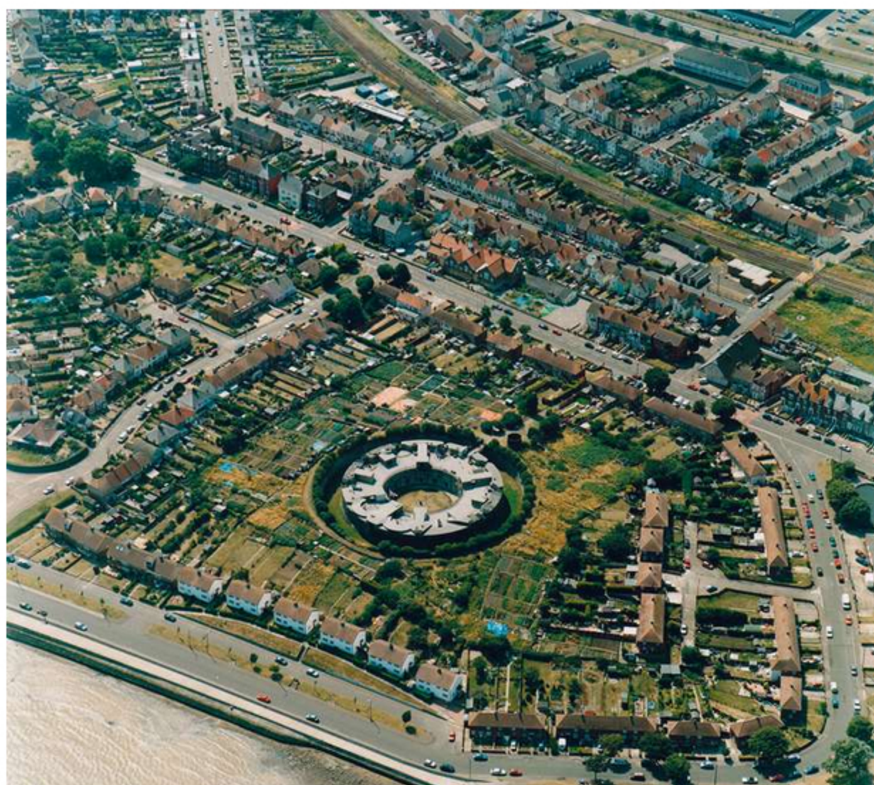
Harwich Redoubt photographed on 22-JUL-2003 (NMR 23161/11).

The Essex NMP project was one of the first projects of the National Mapping Programme carried out by external contractors. Begun in 1993 the mapping of the 190 sheets that cover the county was completed in 2003. The project recorded remains from all periods of history and prehistory, but some of the most interesting finds have come from almost opposite ends of that time span.