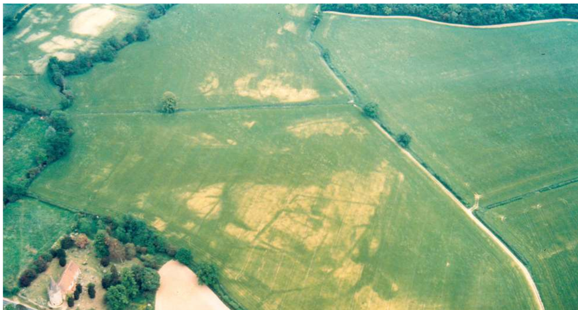
Enclosures of probable prehistoric date showing as cropmarks near Lyons Hall and photographed on 30-MAY-1990 (NMR4579/17)

These showed how important Essex had been during the war and what a large impact had been made by military activities. Although there are some documentary records of sites, a lot were ephemeral and the wartime photographs are sometimes the only accurate record of what was actually built, as opposed to what were planned.