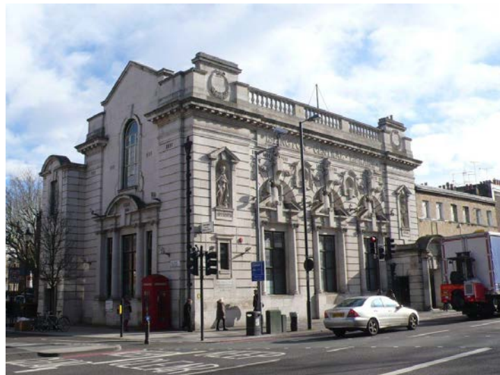
Islington Central Library.