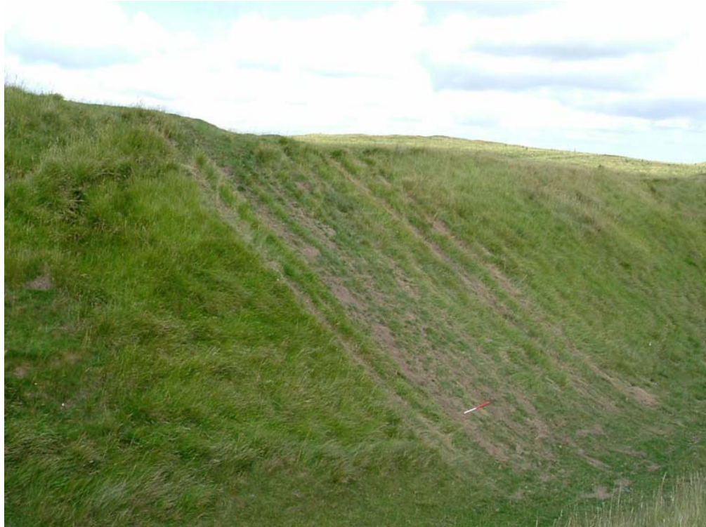
Fig 8. Damage by off-road vehicles; inner rampart, north of the east entrance