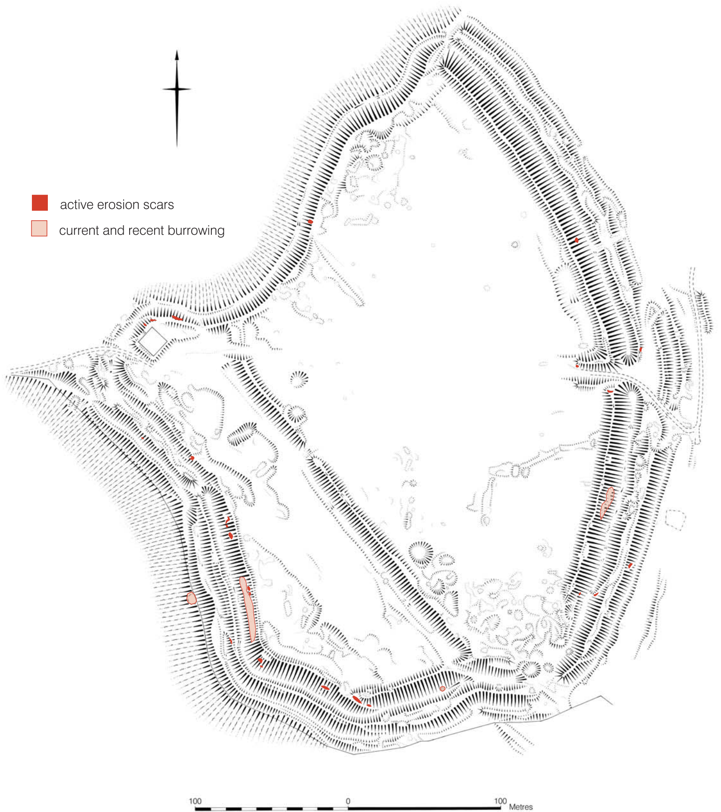
Fig 7. Current erosion scars (over 1m long) and main areas of animal burrowing