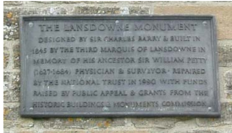
Fig 2. Plaque on the Lansdowne Monument

for flint. A plausible context for this is the turnpiking of the Bath Road and the quarries probably date mainly from the 18 th and 19 th centuries, though a much earlier origin is possible. (Similar dates and purposes for the quarries near the hillforts of Barbury and Liddington have been suggested.) A hill figure in the shape of a white horse was cut on the northern escarpment, below the north-east corner of the hillfort, in the late 18 th century (see Fig 3c and d). The obelisk at the western end of the hillfort was built in 1845 by Lord Lansdowne, ostensibly to commemorate his ancestor, Sir William Petty (Fig 2). The motive may have