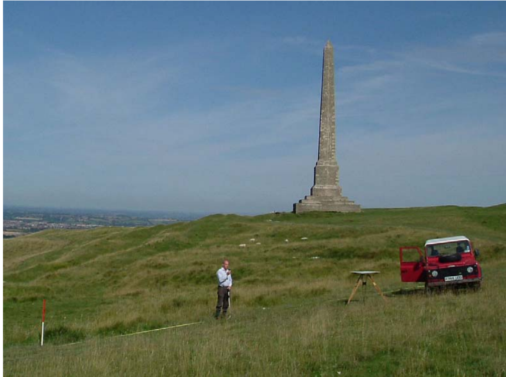
Fig 5. Quarries in the south-western part of the fort

found Iron Age pits by noting hollows on the surface. No definite house platforms were seen; there are four possible ones ( s , t , u , v ) but none of them is convincing. None of them matches the possible house circles seen on the geophysical plots. Hollowing immediately behind the rampart at the southern corner of the fort might be the result of Iron Age quarrying for rampart material, though this is in an area of extensive later quarrying.