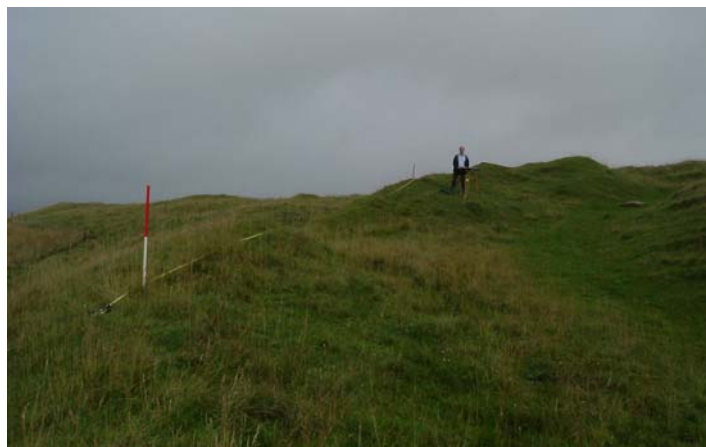
Fig 1. Inner ditch and outer rampart at the west end of the fort; the flat sarsen block can be seen in the ditch bottom, to the right of the figure

Archaeological survey and investigation of Oldbury Castle was requested by the National Trust in advance of repair works to erosion scars at various points around the ramparts. The survey was undertaken by the EH Archaeological Investigation team based at the NMRC, Swindon, during the late Spring and Summer of 2004. The survey encompassed only the area of the hillfort and included none of the other extensive earthworks on the Down.