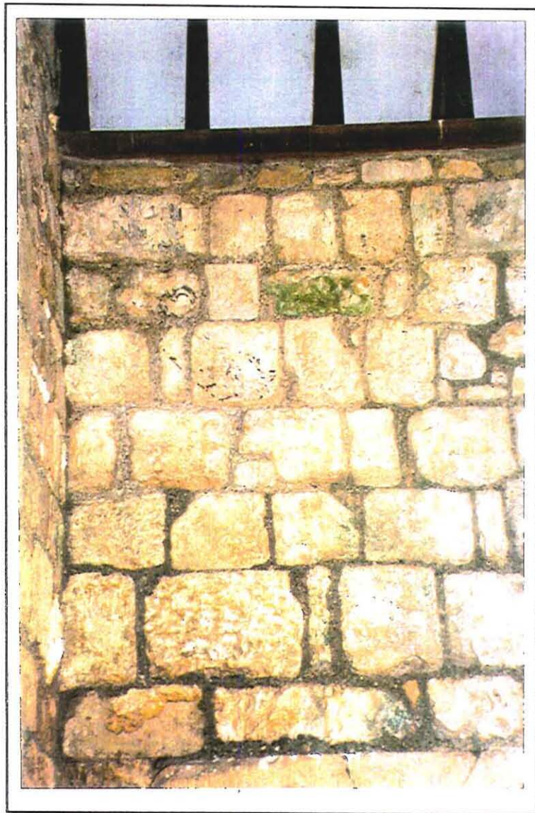
South wall, chancel, east end, traces of text and other decoration