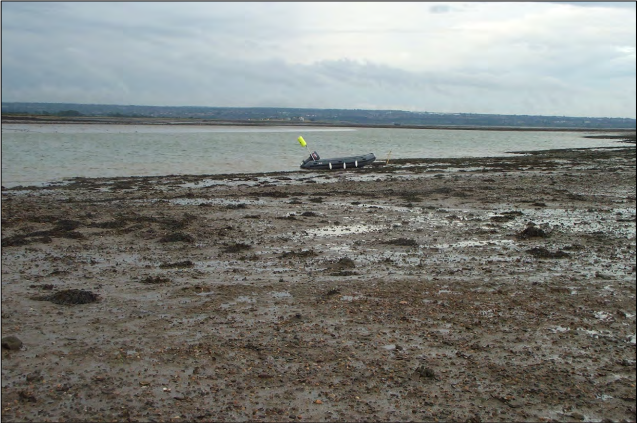
Plate 1: View of the workboat used during the exchange week on Burntwick Island.