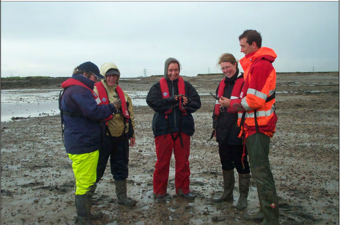
Plate 4: Exchange participants visiting a Romano-British site on Stangate Creek.