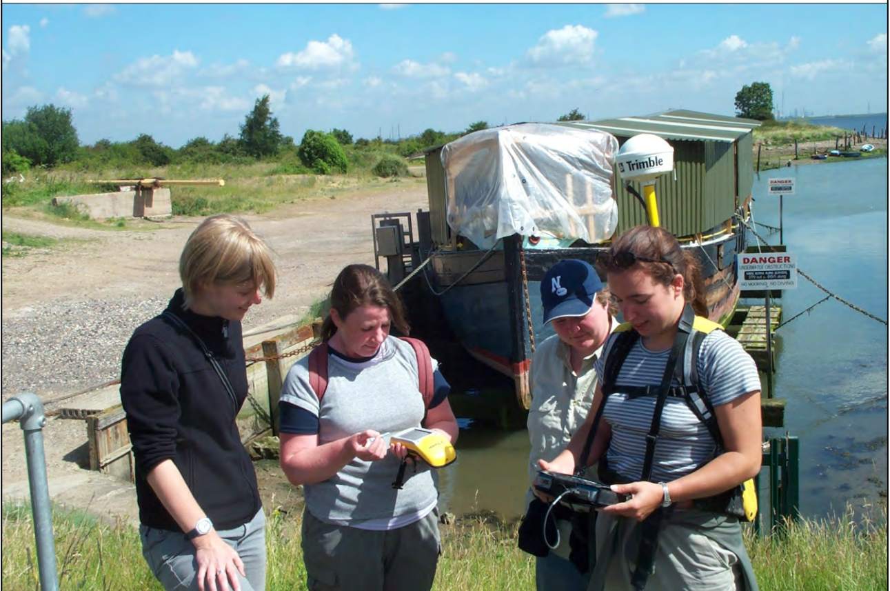
Plate 2: Exchange participants familiarising themselves with the GeoXT and Husky survey units.