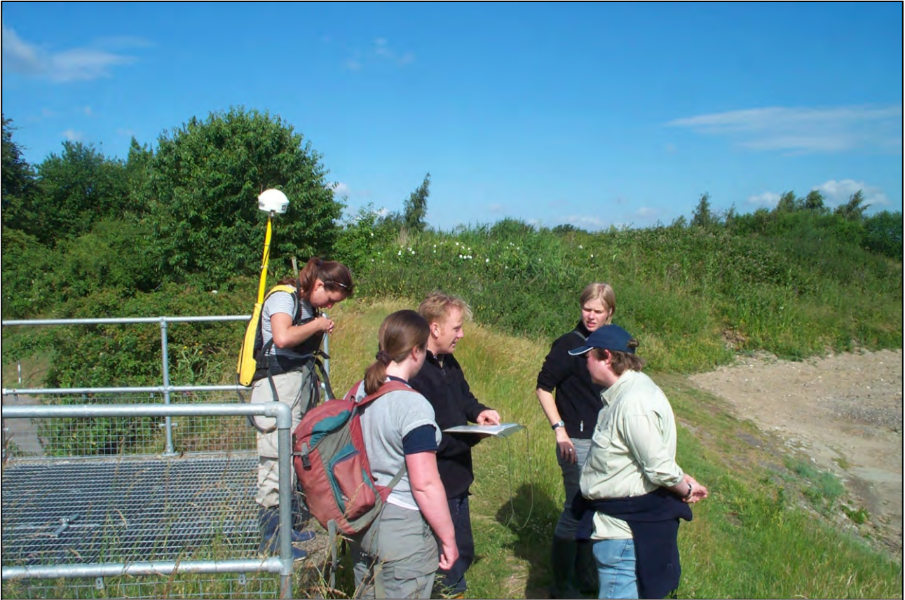
Plate 3: Exchange participants surveying near Lower Halstow.