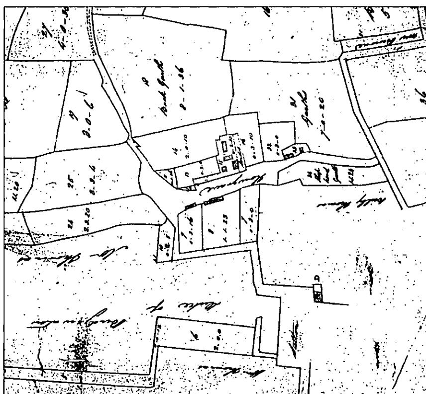
Figure 4 Extract from the 1760 plan of the estate of Philip Bendlowes at Sutton cum Howgrave.

This plan also shows that the land occupied by the former village site was still subject to division at this point, with three unequal plots depicted, two of which have structures at their north-western ends. There is also a broad open area between these enclosures and the wall defining the walled enclosure and the extent of Howgrave Hall, labelled 'Howgrave'. This open area is accessed by a routeway from the west/north-west (labelled 'Public Bridle Route') and by another routeway from the north-east. The fact that this is a broad open area with access from both ends, adjacent to a row of plots, strongly suggests that it was originally a green associated with the former village. Although the plan does not extend far enough south to cover the whole of the area now occupied by Sutton Howgrave, it does show another open area here, this one labelled 'Sutton', in roughly the same location as the present village green. The existence of these two village greens concurs with the evidence