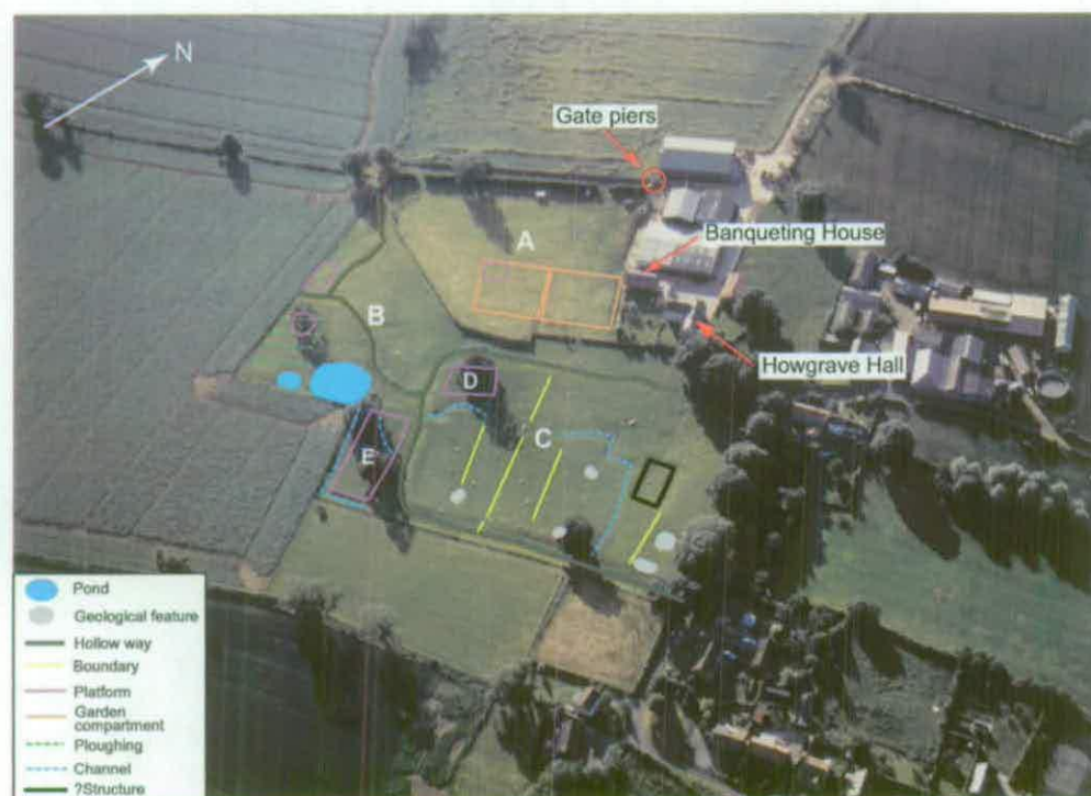
Figure 6 Annotated aerial photograph of Howgrave Hall showing a schematic depiction of the principal features observed during the walk-over survey. NMR 17288/ 17 SE 3179/5 08-Jul- 1999

The north-western part of the walled enclosure is fairly level, with no particular features of note. However, the south-eastern part contains better defined earthwork remains. Parallel with the south-western end of the Banqueting House is a strong scarp, lying at right angles to the south-eastern enclosure wall. This defines a rectilinear area abutting the structure, probably a garden compartment, set at a lower level than the surrounding area. To the south-west of this is another rectilinear area, defined by a very low earthwork bank to the