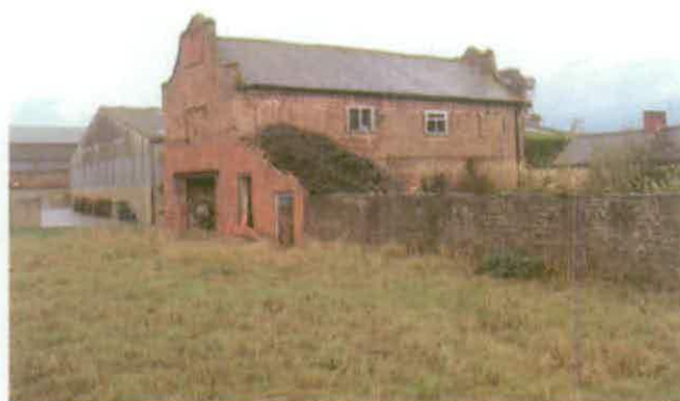
Figure 3 Top: The Banqueting House from the south. These two elevations would have been the 'show' faces of the building.