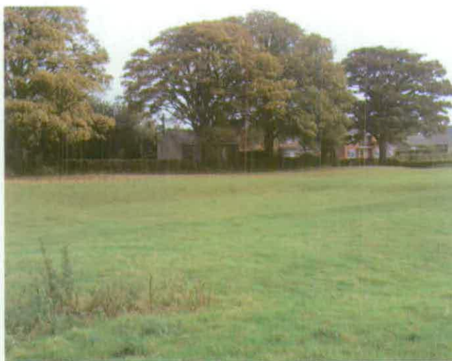
Figure 7 Rectilinear depression close to the north-east of the medieval village earthworks

west to south-east alignment. These correspond with the boundaries shown on the 1760 plan of the village (Figure 4), which, in turn, most likely respect and fossilise boundaries which originally formed part of the medieval village here. On a similar alignment is a deep rectangular hollow at the north-eastern end of the block of earthworks; this is approximately 1m deep in places (Figure 7). A slight bank within the hollow defines a shallow ditch around the interior of the feature. This may represent the location of a large building, perhaps an early incarnation of the manor house. The survival of the ditch would suggest that the building had subsequently been robbed out, with a trench dug to remove foundation stone. However, the ditch may be a little too regular and 'neat' to fully support this theory. Alternatively the feature may be later than the village remains, although their shared alignment suggests a degree of contemporaneity. A more detailed examination of this feature may bring a clearer idea of its original function.