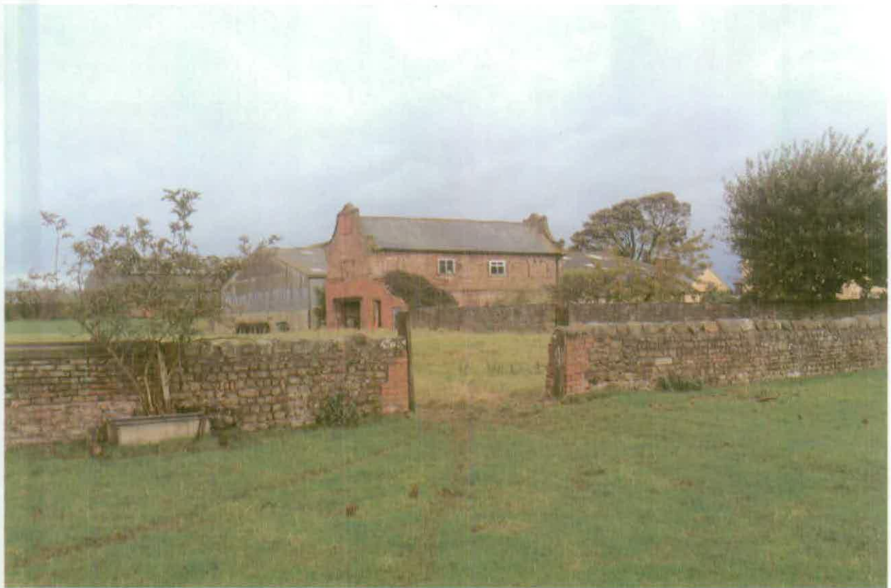
View of the Banqueting House at Howgrave Hall from the south