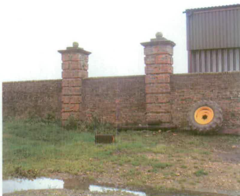
Figure 2 The wall and gate piers to the north-west of the Banqueting House

A rapid walk-over assessment of the site was carried out by Abby Hunt of the AS&I team on 25 October 2005. Readily available historic maps were also consulted as further sources of evidence for change in the landscape. The current report is intended to bring together the results of the assessment and to provide recommendations to aid further understanding of the site.