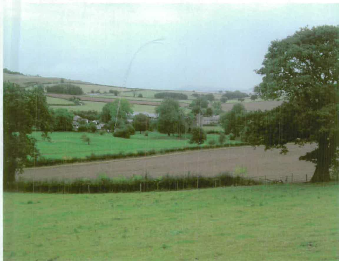
Fig 4: view to the Castle from Hopton Park, across 'Coney Green'

The date of these ornamental features requires discussion. They are probably contemporary with the tower. They are coherent with it, in that they could be viewed from the private apartments on the south side of the tower and would form an important element in the view to