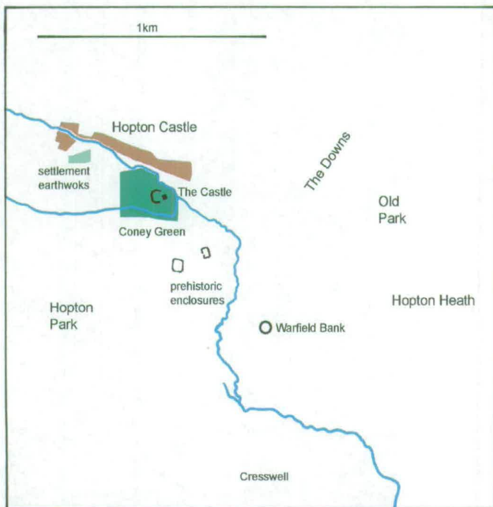
Fig 2: named places and archaeological features around Hopton Castle; north to top; the surveyed area is highlighted in dark green

hamlet rather than a village, and there is at present no nucleated settlement to the west of Hopton.