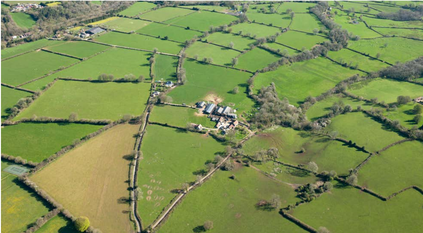
A 17th-century or earlier farmstead site at Ashwick to the north of the area, within a framework of post-medieval enclosure, with a landscape of pre-14th century enclosure from woodland with some woodland strips surviving. The fields around the farmstead with its late 17th-century house were enlarged in the 19th and 20th centuries. The farmhouse was built in about 1700 with an attached dairy, and to the rear a long cow house attached to an early to mid-19th-century stable and barn.