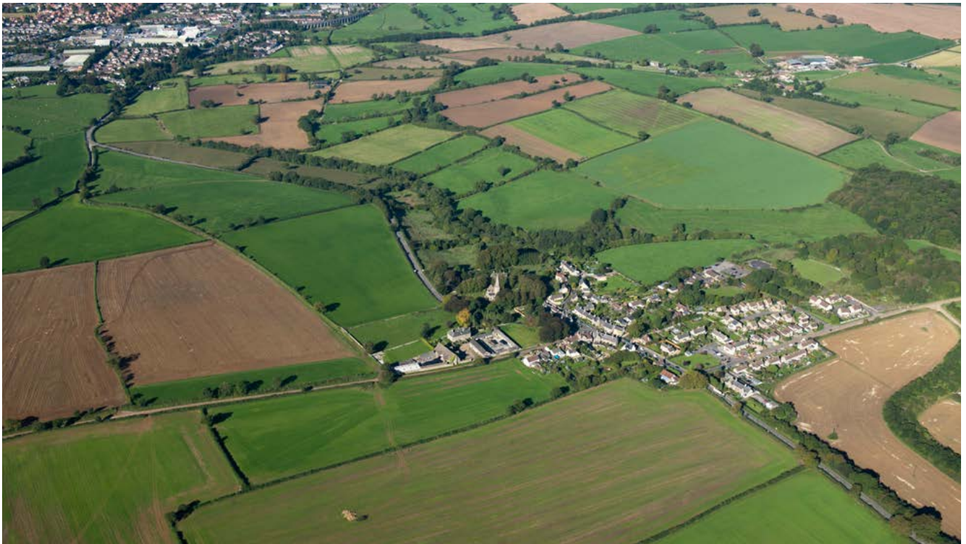
The village of Doultling, the large fields resulting from 17th- to 19th-century enclosure. Manor Farm to the south (left) has a 15th-century barn (see p 8).

The Farmstead and Landscape Statements will help you to identify the historic character of traditional farmsteads and their buildings in all parts of England, and how they relate to their surrounding landscapes. They are now available for all of England's National Character Areas (NCAs), and should be read in conjunction with the NCA profiles which have been produced by Natural England using a wide range of environmental information ( https://www.gov.uk/government/publications/national-character-area-profiles-data-for-local-decision-making/national-character-area-profiles ). Each Farmstead and Landscape Statement is supported by Historic England's advice on farm buildings ( https://historicengland.org.uk/farmbuildings ), which provides links to the National Farmsteads Character Statement , national guidance on Farm Building Types and a fully-sourced summary in the Historic Farmsteads: Preliminary Character Statements . It also forms part of additional research on historic landscapes, including the mapping of farmsteads in some parts of England (see https://historicengland.org.uk/characterisation ).