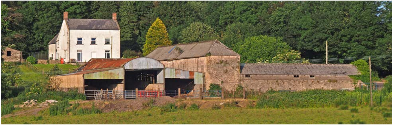
Mid-19th-century farmworkers' cottages at East Harptree, some of which have been converted from earlier farm buildings. These testify to the emergence of large capital farms requiring large workforces over the 19th century. Photo © Historic England DP0864