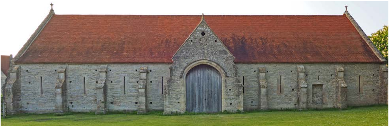
Another one of the Glastonbury barns, this is the example at Pilton which has been restored by the Pilton Barn Trust with the assistance of Michael Eavis, founder and organiser of the Glastonbury Festival.