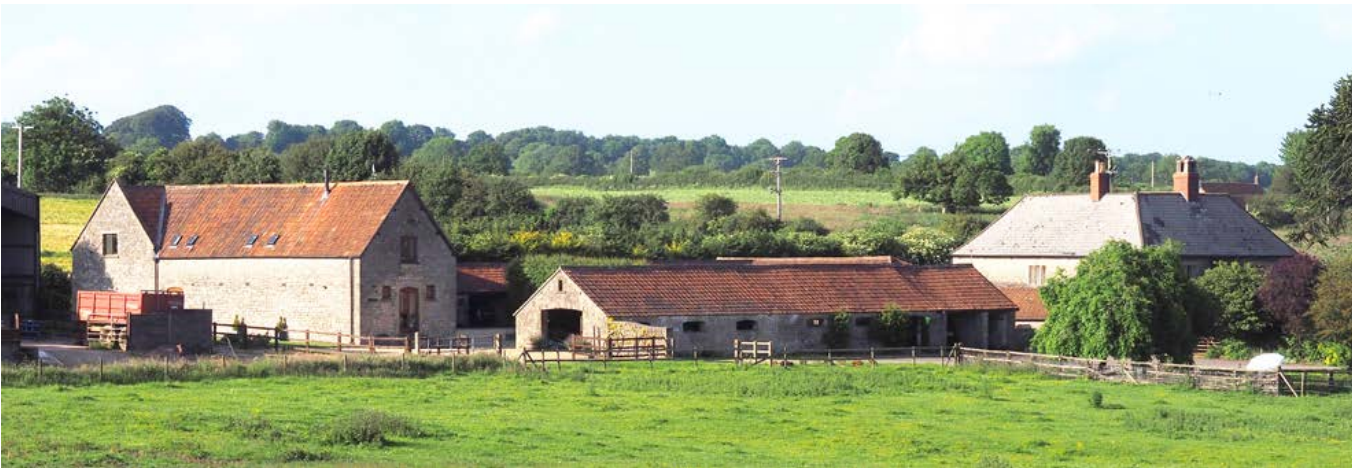
A mid-19th-century farmstead near Charterhouse, note the large size of the farmhouse and barn, and the low cattle-housing range.