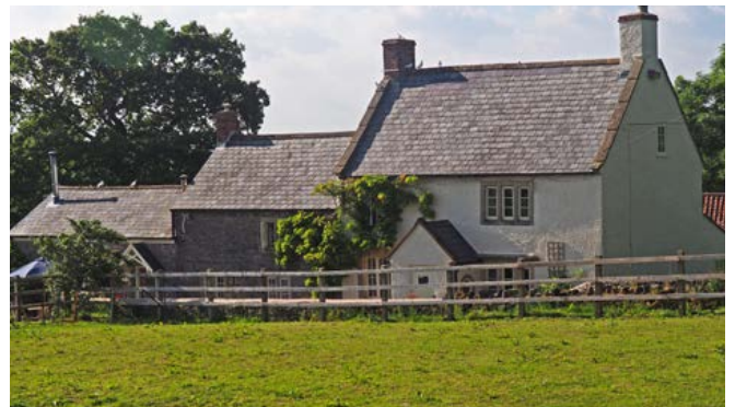
Across the area, there is extensive evidence for the rebuilding of houses in the late 17th and early 18th centuries, although working buildings are rarely of this date. This may be due to the importance of a dairying economy in this area which required few working buildings other than small threshing barns.