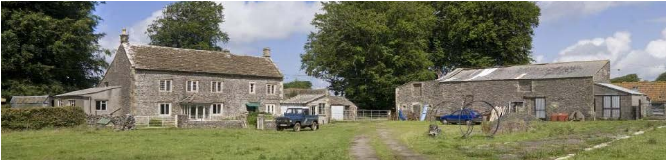
This farmstead facing the green in Priddy was probably rebuilt in the 1830s, retaining the core of a 17th-century house; an L-plan bank barn and stables were put up in two phases, presumably only a matter of a few years apart. The rear entry is reached from the pasture via a set of steps, not by an incline or bank.